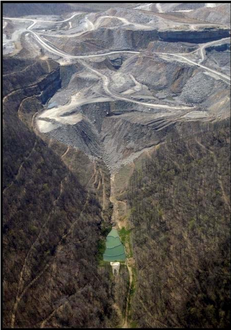
Figure S1. (Left) Aerial view of a southern West Virginia (WV) mountaintop mining site with valley fills. [photo by Paul Corbit Brown] (Right) Perennial streams below a Kentucky valley fill (top) [photo by Ken Fritz] and a WV valley fill (middle) [photo by Jack Webster] show visible pollution from trace metals. Unimpacted perennial streams such as this one in WV have generally clear water and are without metal deposits on the streambed such as those in the two photos above (bottom) [photo by Jack Webster].