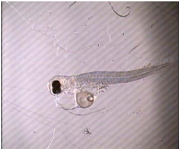
Figure S2. Impacts of selenium emanating from MTM/VF impacted streams of the Mud River ecosystem, West Virginia has bioaccumulated in food webs up to 4x the toxic level; it causes teratogenic deformities in larval fish such as those shown here. Below: two eyes on one side of the head; right: spinal curvature (S7).